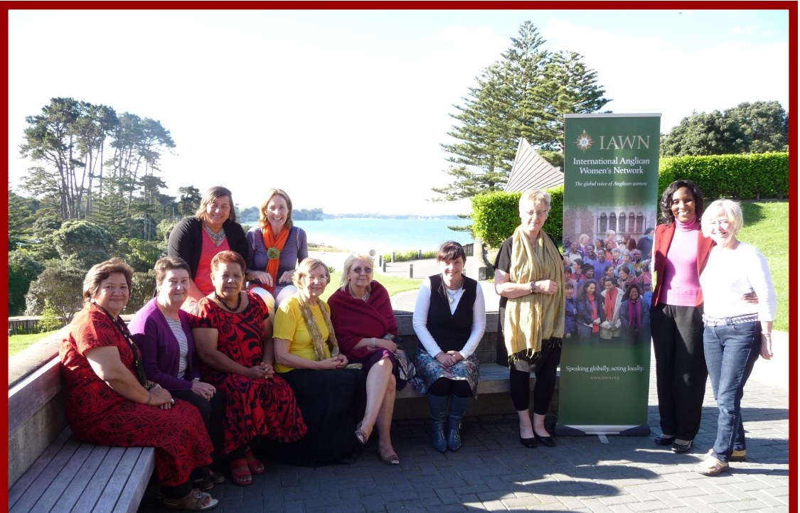
The Anglican Women's Studies Centre Council welcomed members of the Steering Group for the International Anglican Women's Network to New Zealand

Our Place, Our Voice was launched a few days before the commencement of the Anglican Consultative Council (ACC) Meeting in Auckland, with representatives from the International Anglican Women's Network (IAWN) at Vaughan Park on Wednesday 24 th October 2012. It was a significant occasion to launch our book in the presence of women from around the world, whose main purpose is to enable and empower all women to be influential and equal participants throughout the entire Anglican Communion . This occasion gathered those who celebrated with us in the launching of this book, and also acknowledged many more women who were unable to attend. It captured the significance of sharing women's stories.