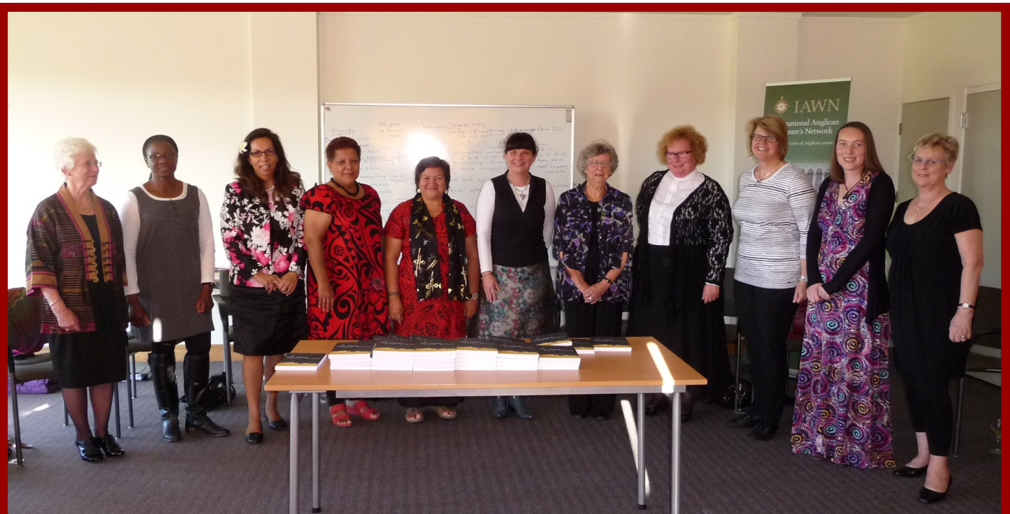
Many of the contributors to "Our Place, Our Voice" were able to join the Council at Vaughan Park to help launch the book. The Council was grateful to benefit from either their writing or their publishing expertise that they offered.

As Convenor of the General Synod Council for Anglican Women's Studies it is a pleasure and a privilege to offer this treasure to you.